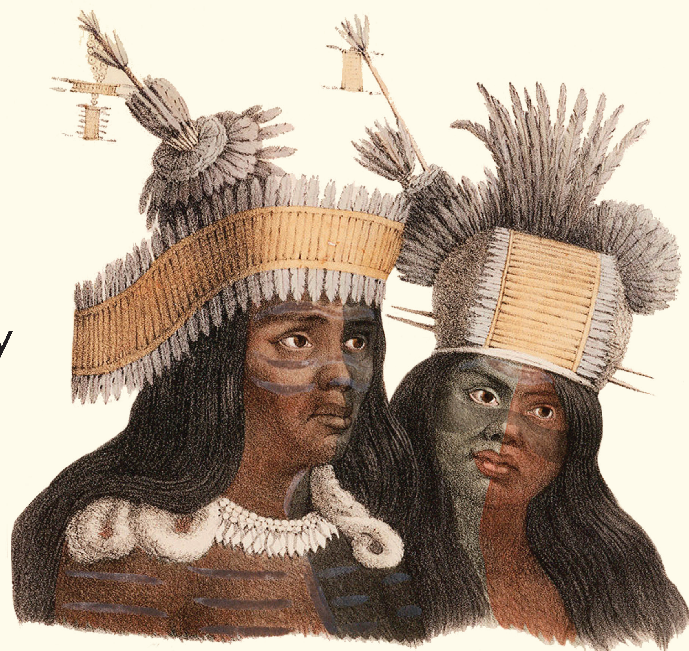
Lithograph by Louis Choris, Coiffures de danse des habitants de California , from Voyage Pittoresque autour du Monde , 1822. Autry Museum, Los Angeles; 92.6.2

The Ohlone people are Native American people who lived on the aboriginal lands between San Francisco and Monterey Bay for over 10,000 years. Before Spanish colonialization, their traditional way of life was relatively stable until the arrival of the Spanish missionaries in 1769. Mission San Francisco de Asis (also known as Mission Dolores) was founded in 1776.