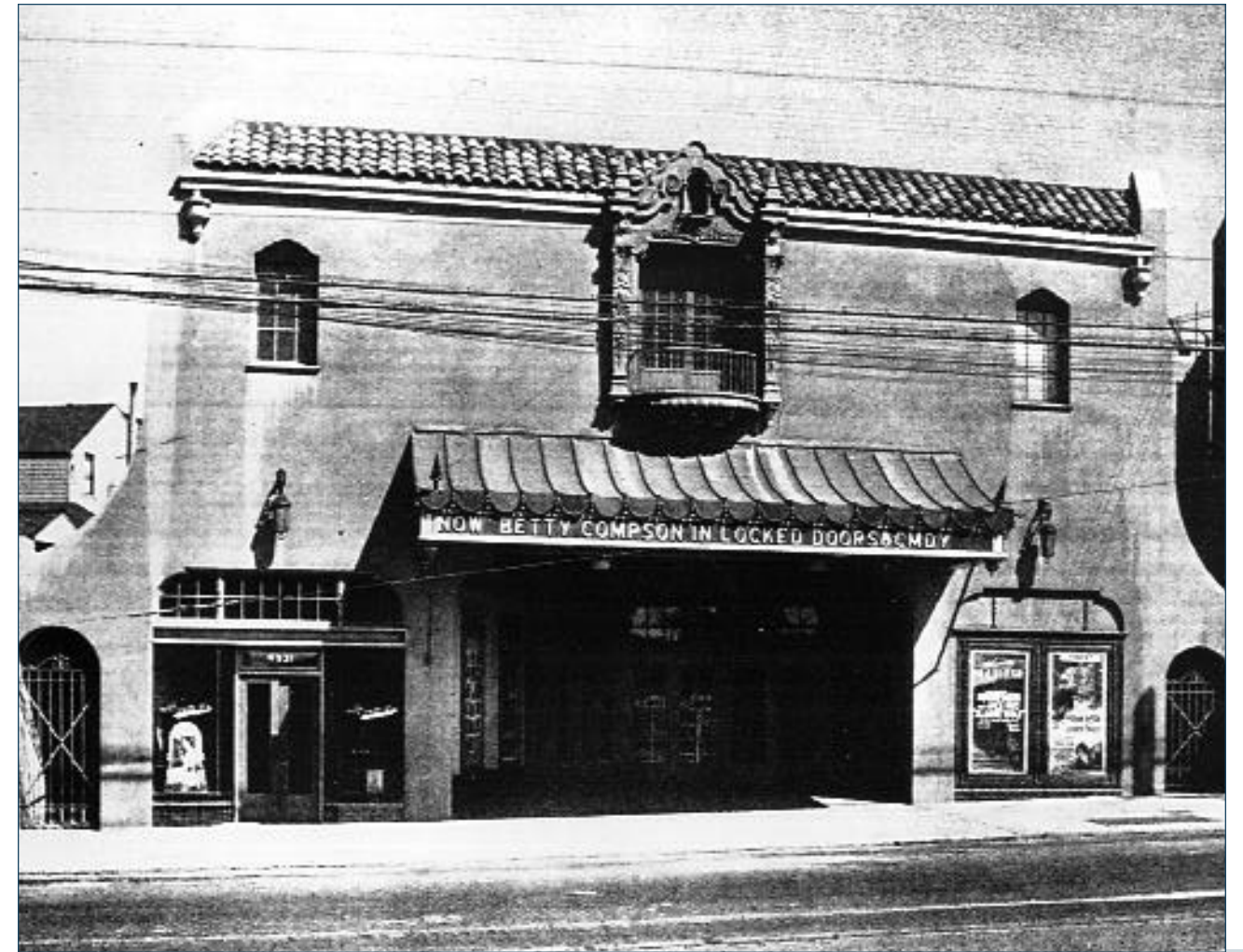
Bayview once had a theatre on Third Street. The Bayview Theatre at 4935 Third Street opened in 1924 and closed in 1957.

“The argument in the community debate is not about blocking development but about what kind of development and its impacts on our sons, daughters, children, adults, and elders.”