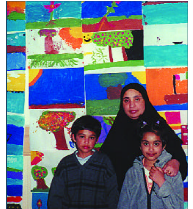
Budding young artists show off their artistic talent as part of the Children's Mural Project at the Bayview Opera House.

The strong presence of existing murals on public buildings celebrates the past and present in a rich and powerful manner. Public art that connects people to place—especially historical or environmental artworks—enriches the everyday