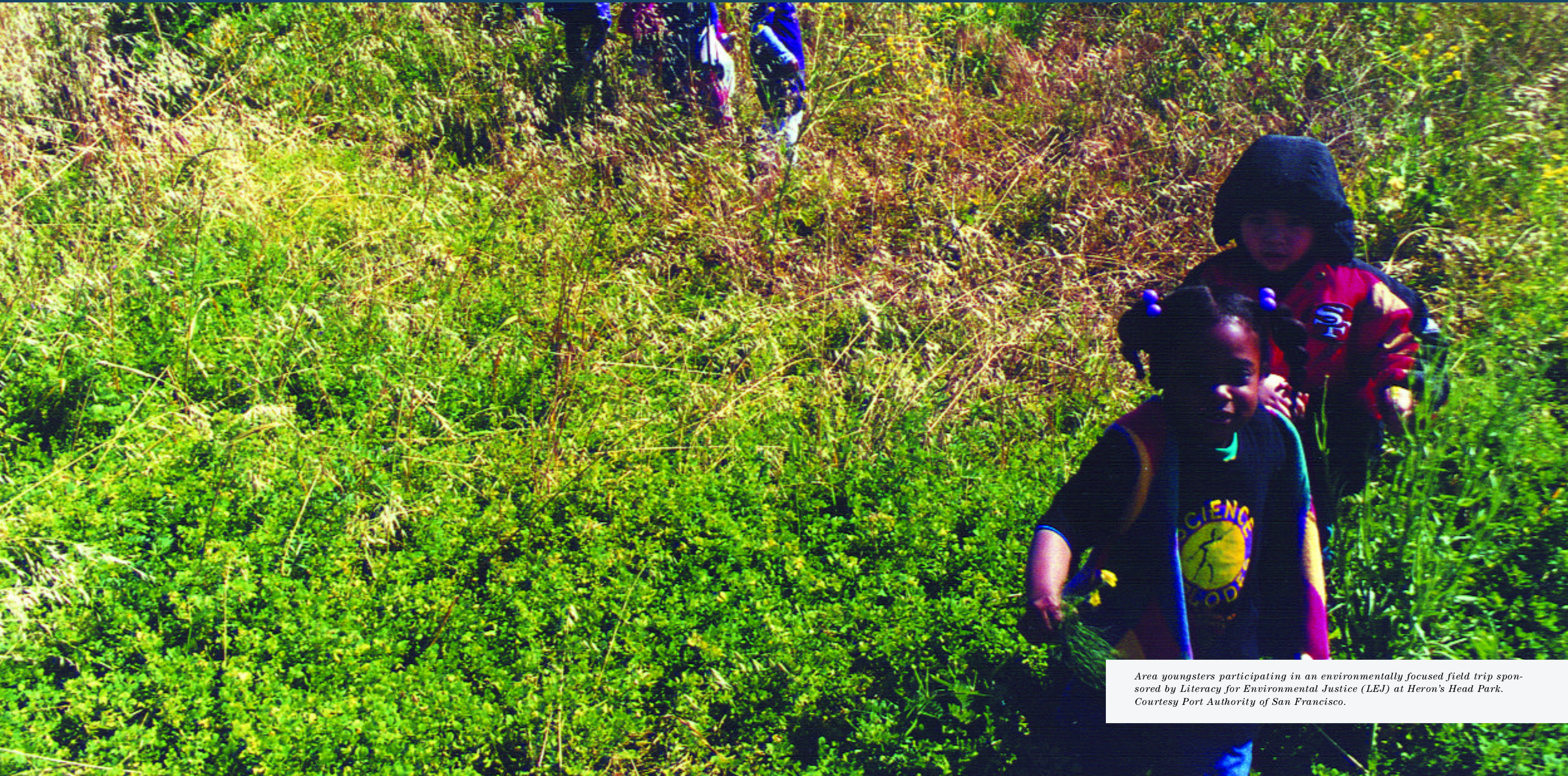
Area youngsters participating in an environmentally focused field trip sponsored by Literacy for Environmental Justice (LEJ) at Heron's Head Park.