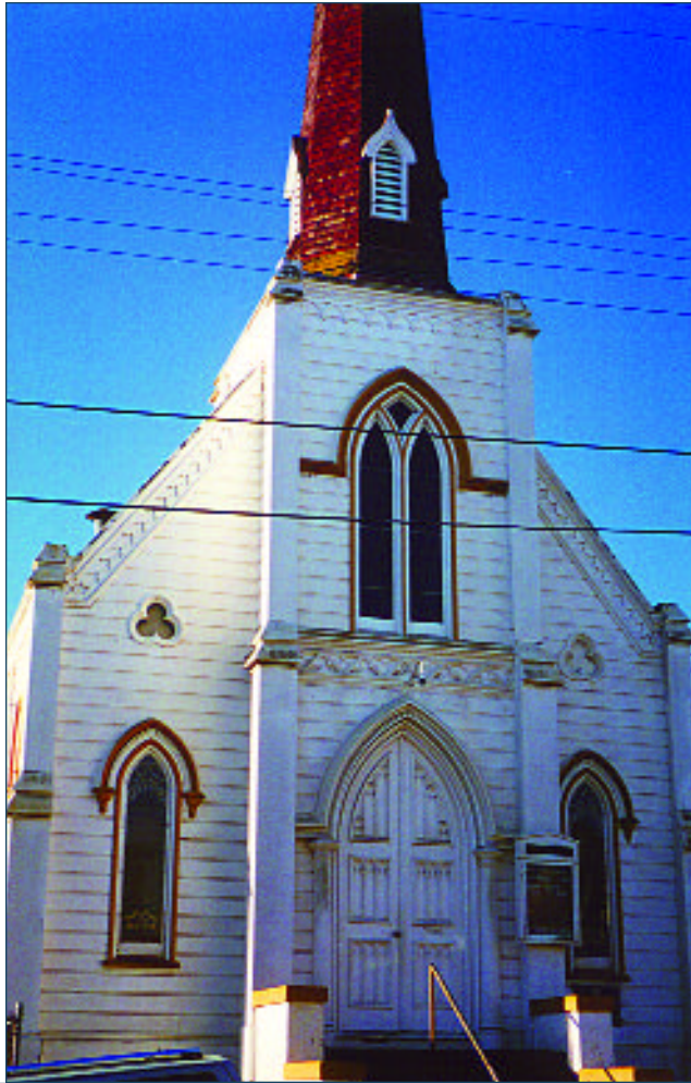
Historic neighborhood church and gathering place.

planning for the future, creating housing partnerships, sharing facilities, and linking open spaces to religious institutions is desired. Also important is utilizing them as a communication resource to energize people with the vision of a revitalized future.