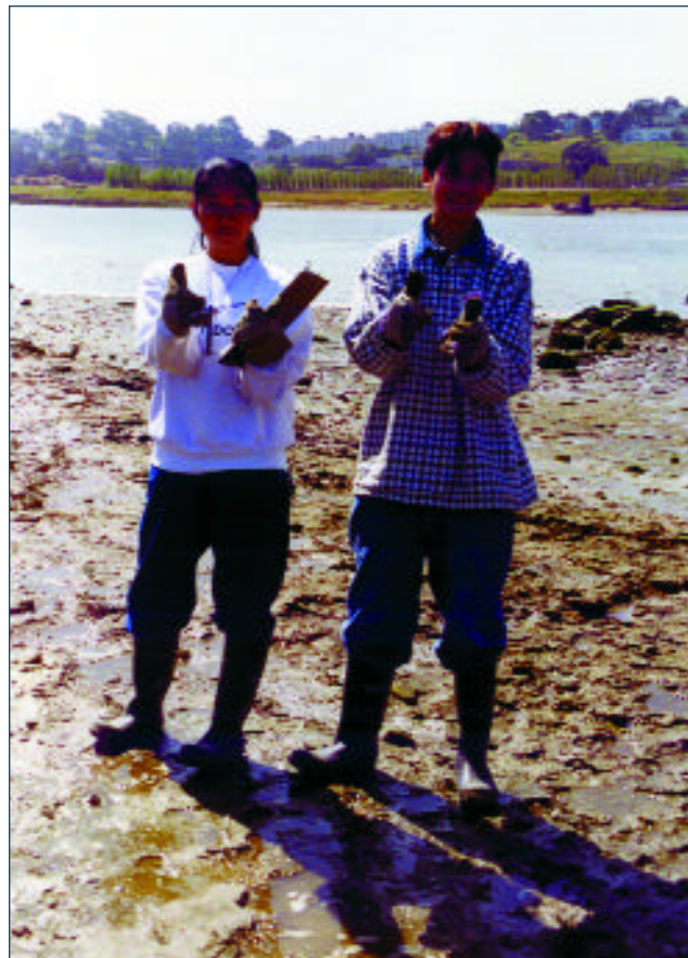
Youth learning about Bayview's rich waterfront environment at Pier 98.