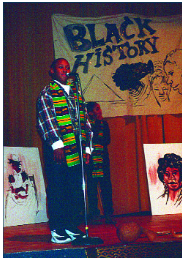
Celebrating black history at the Bayview Opera House.

One supremely important value held in common by members of the community is the desire to be a stakeholder, having a place to call home and opportunities for both personal growth and family well-being. One of the greatest resources of Bayview Hunters Point is the political