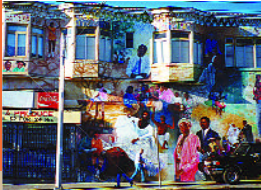
Third and Palou community mural in the heart of Bayview's commercial corridor.

“The main issue is economic development and how to make it work for Bayview Hunters Point. We need to bring together like-minded community individuals and organizations to jointly develop a community project.”