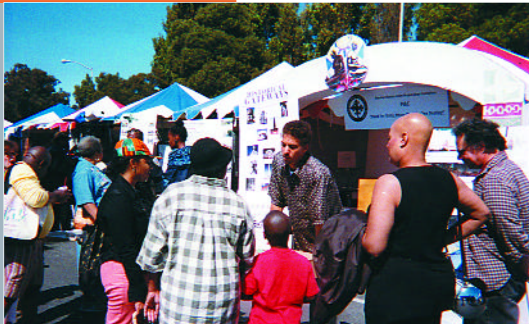
Sharing resources and information at the Third Street Faire.

“The waterfront is Bayview Hunter Point’s major asset. We have to protect the waterfront and use it as a major resource for (the community). The waterfront provides opportunities for everyone. The waterfront needs to be keyed upon by the community.”