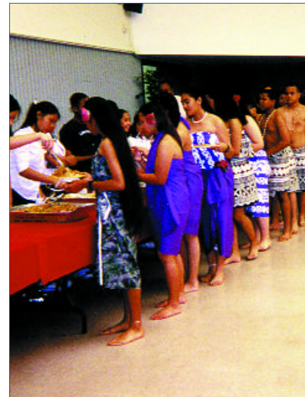
Celebrating culture at the Southeast Community Facility.

Being an American can mean feeling conflicted, requiring a balance between one's heritage and the idea of the strong individual as a member of society. Revitalization in complex communities of color requires a balance of acknowledgment of differences and commonalities, ensuring equal empowerment. Civic and communal celebrations of all commonalities and diversities are a powerful means for achieving these goals. Unifying traditions are value-based and, although diverse in their beliefs and views, all members of this community—whatever their ethnic traditions—share the desire for a clean, safe, beautiful and vital place to call home. This is the shared destiny of Bayview Hunters Point. The differences that do emerge are to be valued in themselves, celebrated as strengths in an arena of respect.