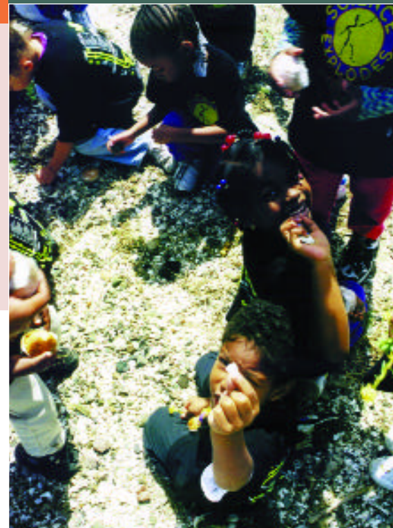
Bayview youth learn that science is fun!

San Francisco has a problem that no one could foresee: the uneven distribution of children within the City limits... Existing schools are fine; children should be sent there. However, the SFUSD (San Francisco Unified School District) needs to recognize the need to build a community partnership to address the impact of various options.”