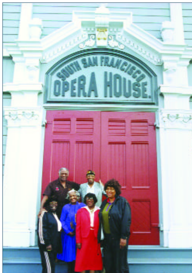
Designated Landmark No. 8 by the City and County of San Francisco, the Opera House is the sole surviving theatre of pre-fire San Francisco.

Street has been the heart of Bayview, with the once-vital commercial district and civic facilities. Although the Town Center commercial district is in need of physical and economic restructuring, the community's greatest assets are located in its midst. Among them are the historic Bayview Opera House, the Joseph Lee Recreation Center, the Southeast Community Facility, the Anna E. Waden Library, a number of community churches and a host of non-profit organizations providing valuable services to area residents. This is a particularly strong aspect of community form that already provides a strong setting for enhancing civic traditions.