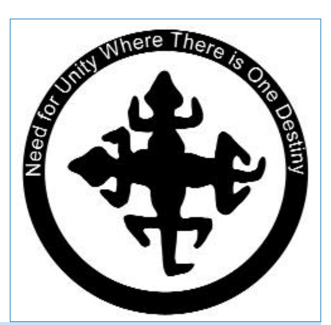
The Bayview Hunters Point PAC's logo is an Adinkra symbol signifying the need for unity where there is one destiny.

The PAC has worked diligently over the last five years to prepare a community-based framework defining a long-term vision to guide future growth, prioritizing programs, and assessing development proposals. Recommendations and specific plans developed through this process are outlined in this Revitalization Concept Plan to guide implementation of the community's revitalization goals.