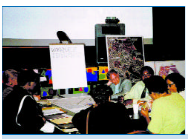
Outlining strategies for revitalization in Bayview's "Town Center" during a public workshop in 1998.

In 1995, the City's Planning Commission approved the South Bayshore Area Plan . In 1999, the community requested the document be renamed the Bayview Hunters Point Area Plan . After the creation of the City's Area Plan , community leaders requested the development of a detailed Community Revitalization Plan. This is that plan.