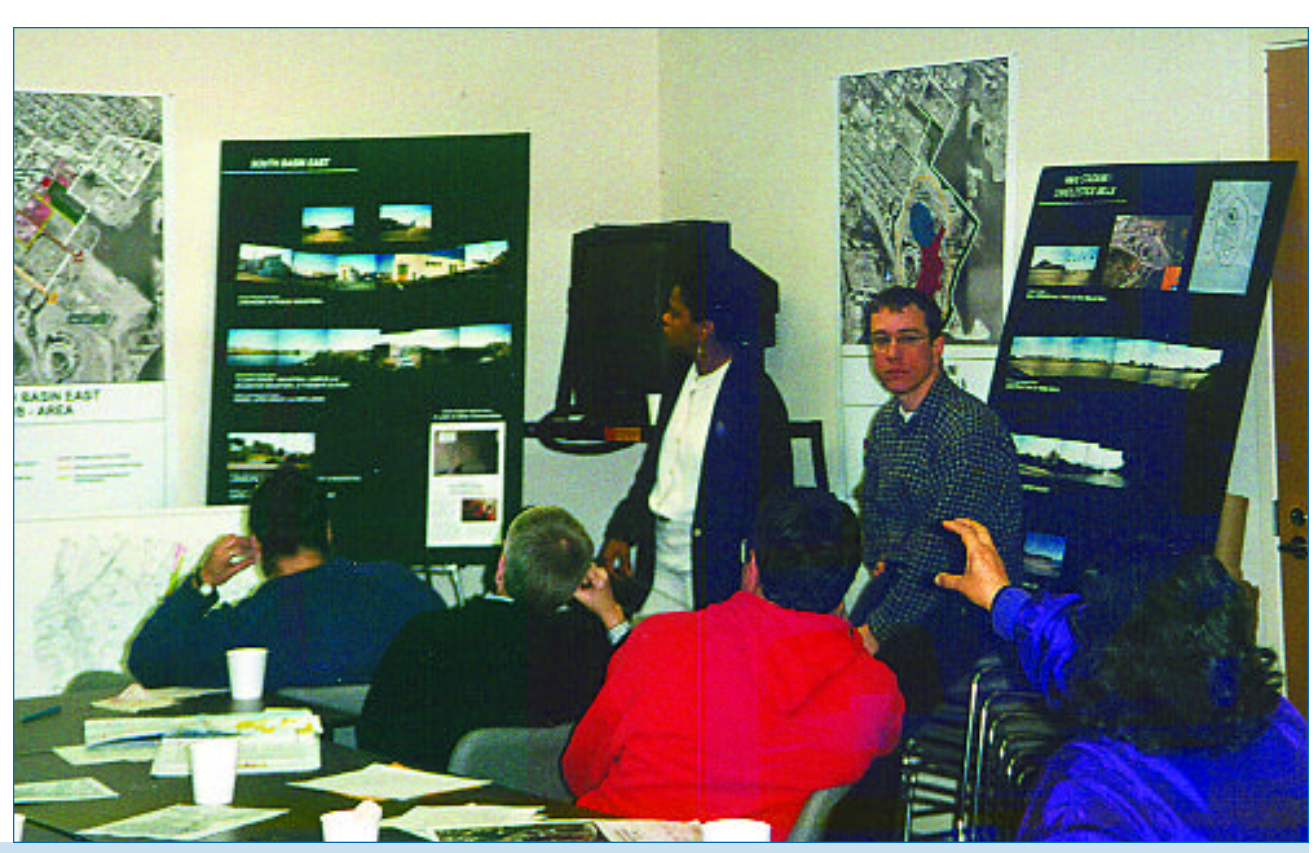
PAC members meet with San Francisco's Redevelopment Agency and Planning Department staff to review neighborhood issues and advocate for desired projects and necessary programs.

recommend the use existing program resources, and chart City activities. As revitalization projects are completed, it will be amended to include new activities in the next five-year cycle.