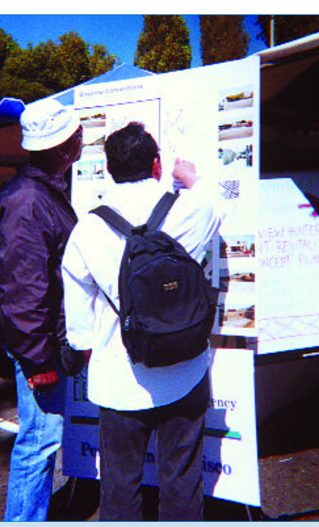
Community members discuss transportation issues and opportunities at the PAC's Third Street Faire booth.

Community goals, strategies, and program needs were identified through a facilitated community process. The process in itself has served to build a solid foundation for revitalization activities. This process will continue to lead the community through creative problem-solving, thoughtful discussions of implementation plans and development alternatives, and the tough decision-making required to see ambitious plans to realization. The history and context of the community process for this Revitalization Concept Plan is described next.