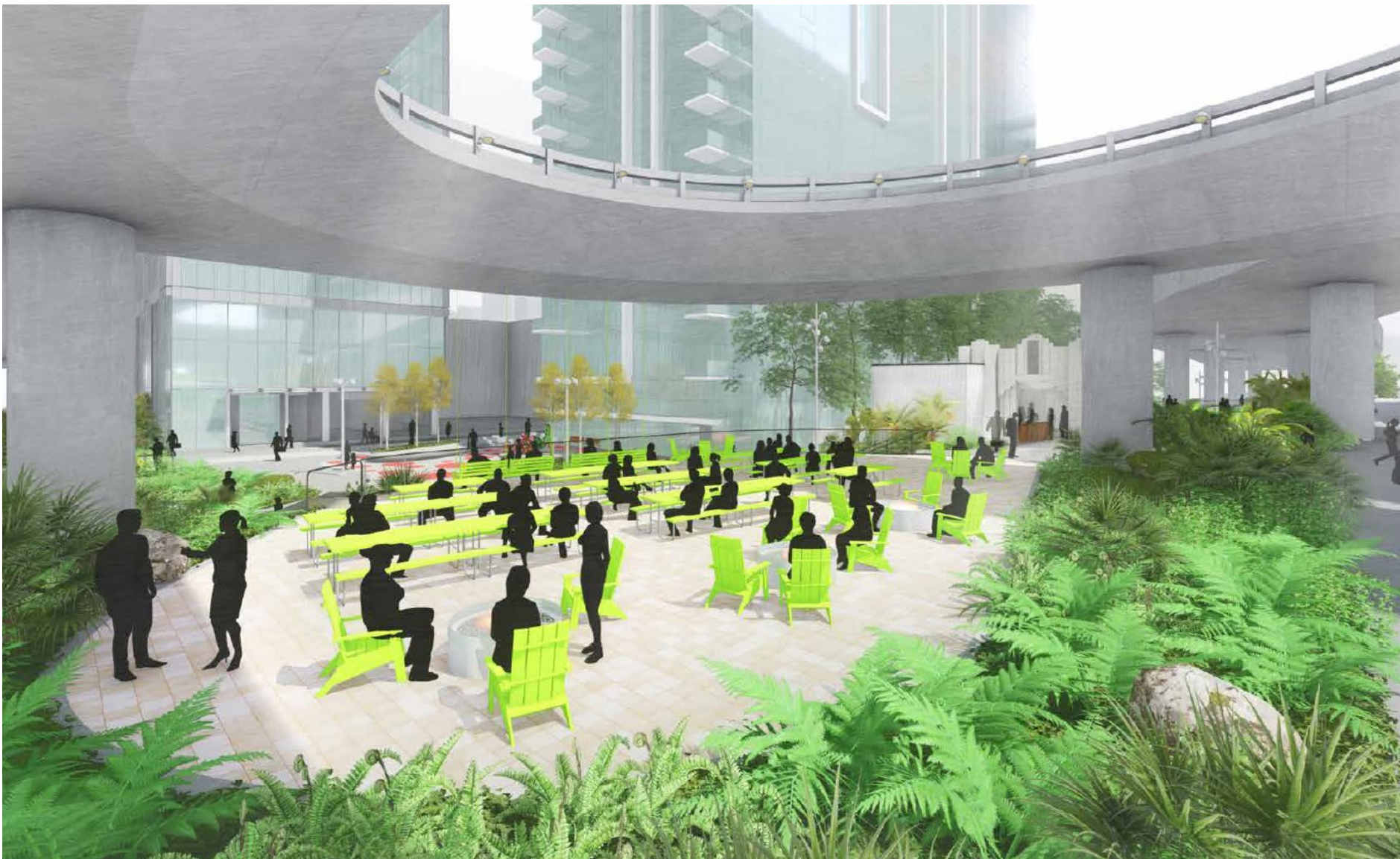
Perspective View: Concession Seating Area