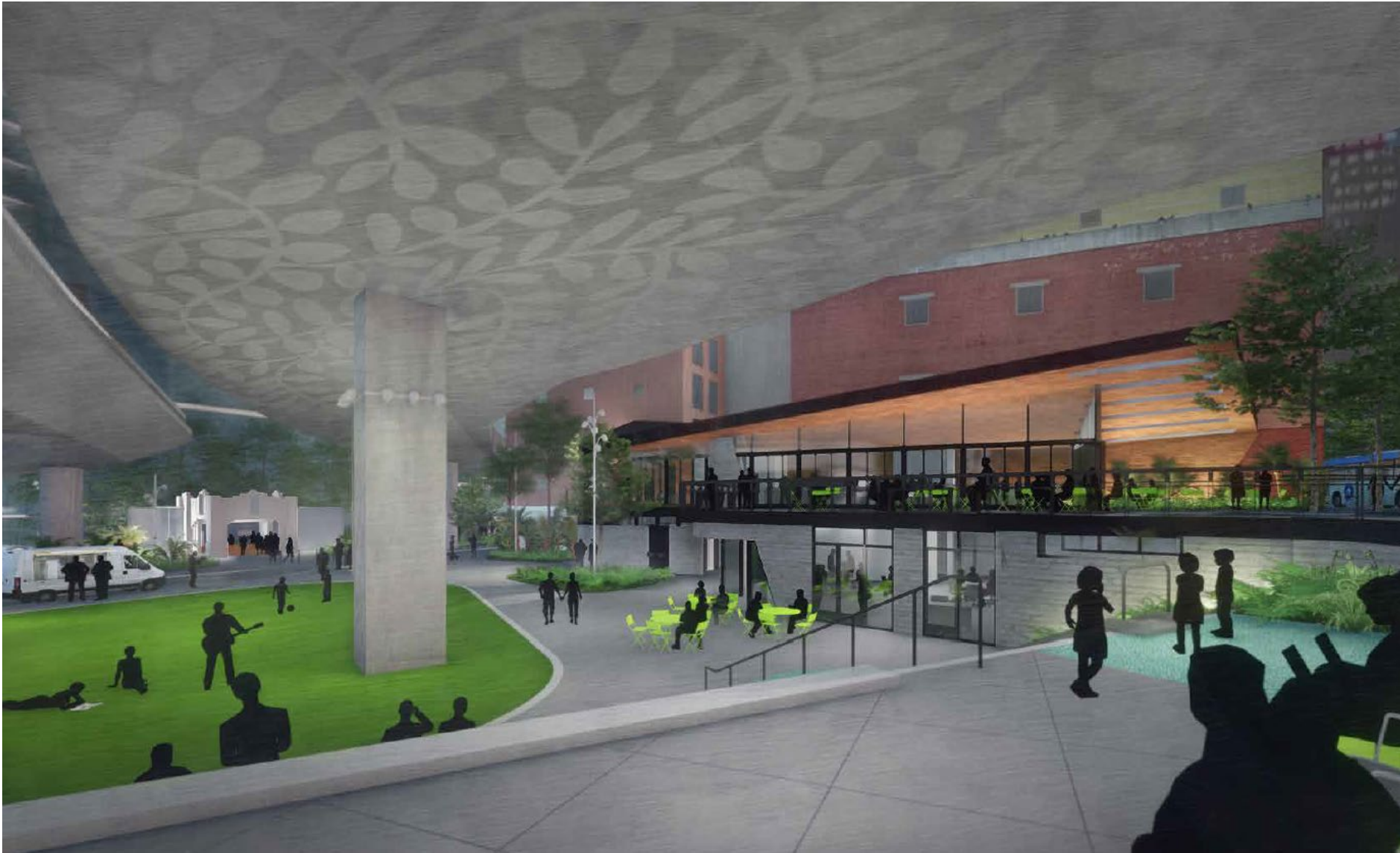
Perspective View: Lower Pavilion at Flex Lawn Area