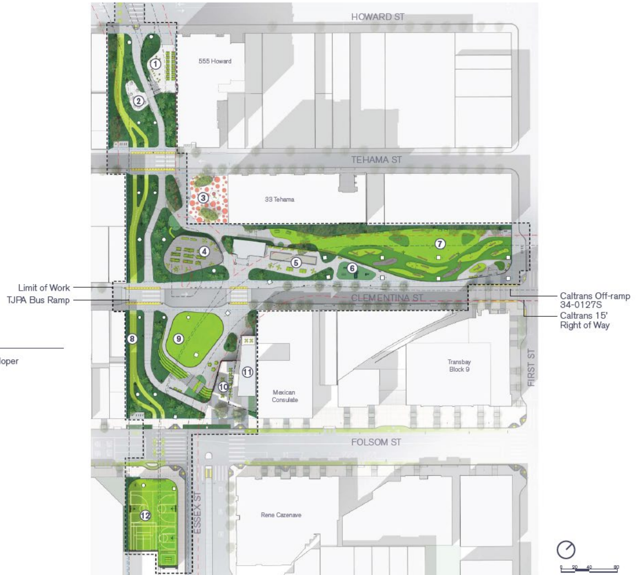
URP - Overall Site Plan